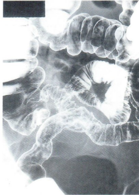
Fig. 4 Close up view of the ileo-caecal region. The caecal pole is persistently distorted with thickened, serrated terminal ileal folds.