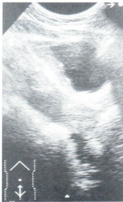
Fig. 2 Sagittal ultrasound shows a fixed undulating plaque at the bladder dome.