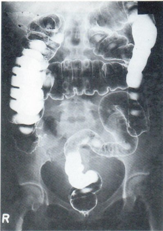
Fig. 3 Barium enema AP radiograph. Extrinsic lesion at the caecal pole distorts the outline. The rest of the colon is normal.