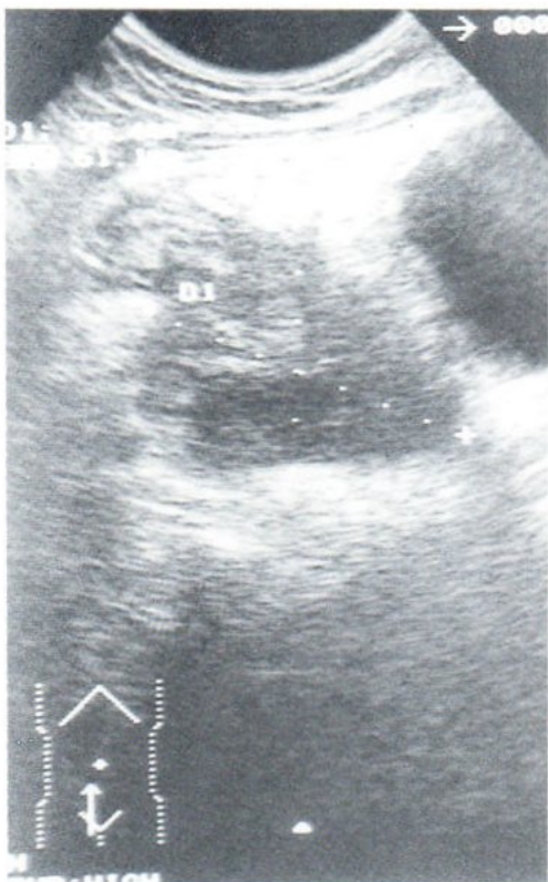
Fig. 1 Sagittal ultrasound shows a mixed echogenicity mass at the right iliac fossa, closely related to a loop of bowel superiorly.