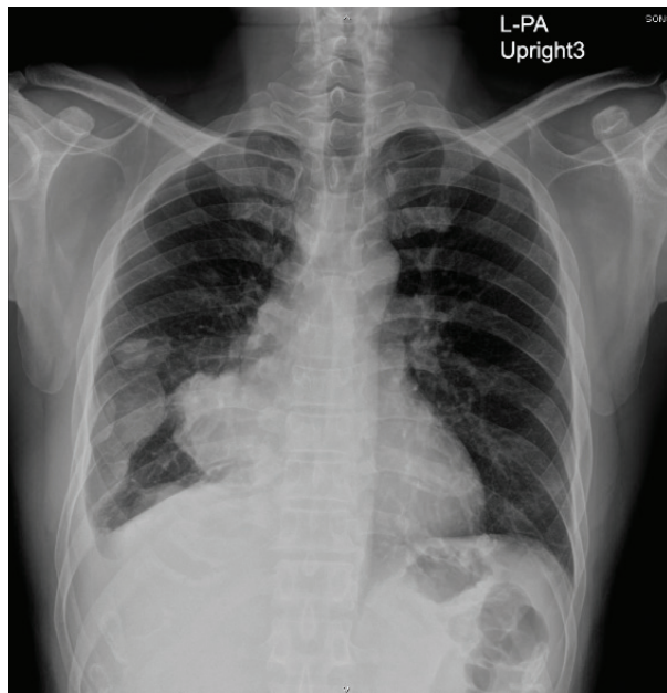
Figure 1. The initial chest radiograph reveals an anterior mediastinal mass and an adjacent pleural mass in the lower part of the right hemithorax.