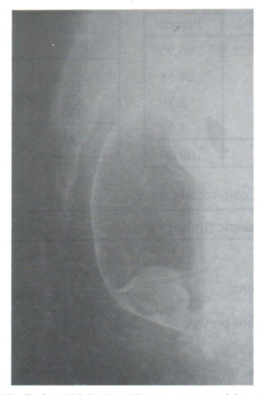
Fig.3 Polypoid lesion. Prone cross-table rectal film showed a 3-cm polypoid mass at posterior aspect of lower rectum with a broad base and lobulated surface.

Fig.2 Semiannular lesion. Spot radiograph of splenic flexure of colon showed a 3-cm saddle lesion that was straddle one-third of circumference of the mesenteric site of distal part of transverse colon.